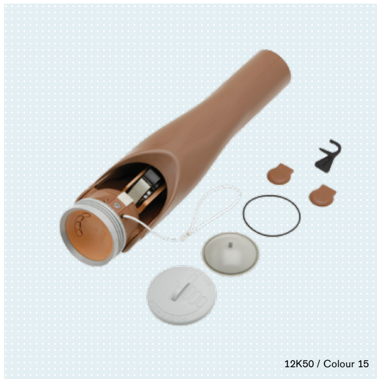
12K50 / Colour 15

The 12K50 ErgoArm Electronic plus is recommended for use with myoelectric prosthetic hands. With the same features as the ErgoArm Hybrid plus, it goes even further: thanks to the electronic lock, unlocking and locking the elbow joint is done by means of myoelectric signals sampled using electrodes.