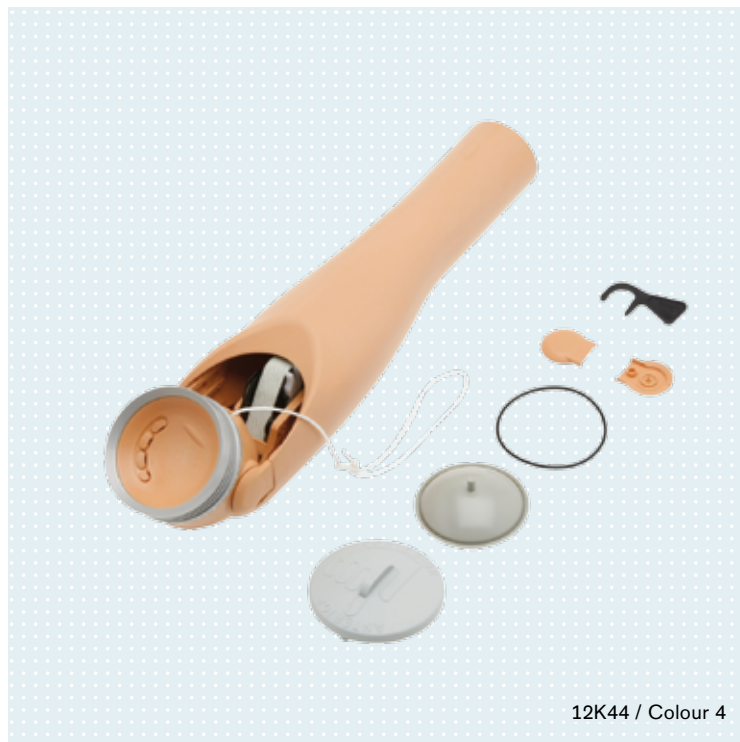
12K44 / Colour 4

In addition to the functions of the ErgoArm plus, the 12K44 ErgoArm Hybrid plus features Easy-Plug integrated internal wiring. This elbow component is especially well suited for use in hybrid prostheses with a myoelectric hand and an elbow joint lock operated using a body harness.