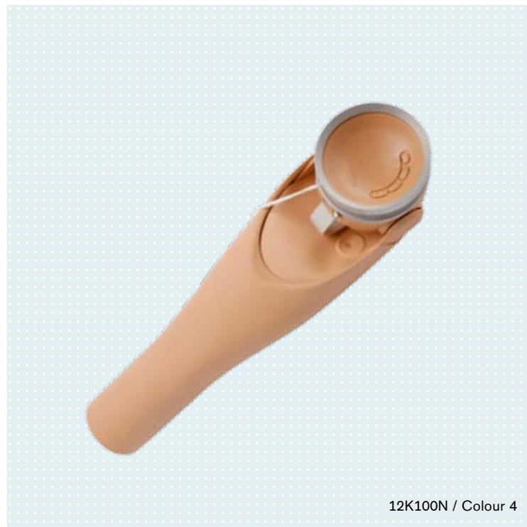
12K100N / Colour 4

The low level of operating noise optimised by means of sound engineering and the slightly dampened and completely silent free-swing phase support the inconspicuous appearance of the prosthesis. These special technology features are integrated in an elbow joint-forearm system with a natural, anatomic design. The shape and basic colour blend in with the overall image of the human body. Silicone elements dampen noises and shocks that are caused, for example, when leaning on a hard surface.