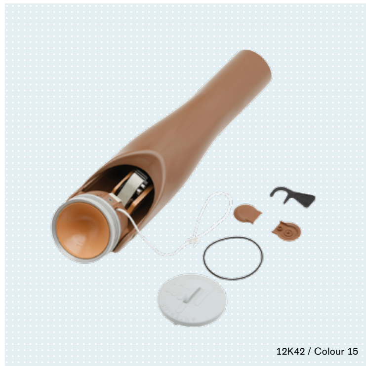
12K42 / Colour 15

The 12K42 ErgoArm plus mechanical elbow joint is suitable for passive and cable-controlled prostheses. With the same features as the 12K41 ErgoArm, it also offers enhanced comfort thanks to the flexion assist.