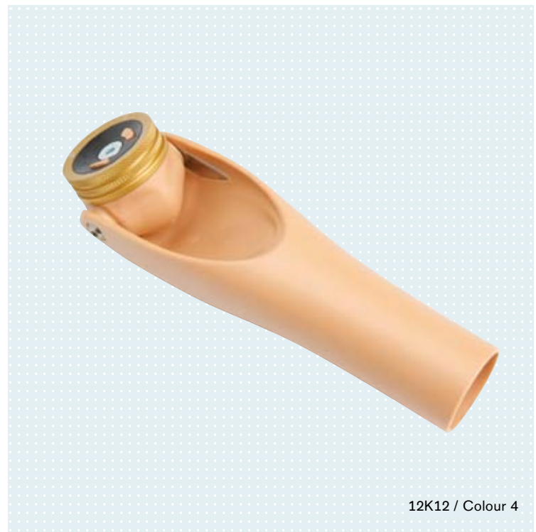
12K12 / Colour 4

The MovolinoArm Friction has one friction setting for humeral rotation and one for flexion or extension of the forearm. Parents can easily adjust the friction setting – a significant improvement in flexibility.